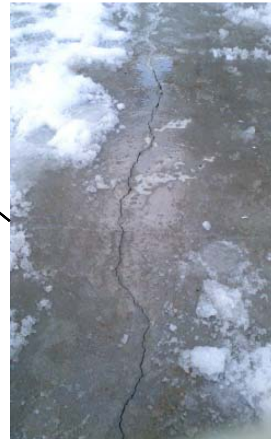
H-4 East area