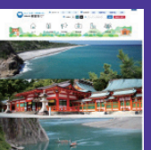
As of 2024/6/5