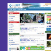
As of 2014/6/5