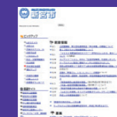
As of 2004/6/18

▼ Shingu City (Wakayama Prefecture) website